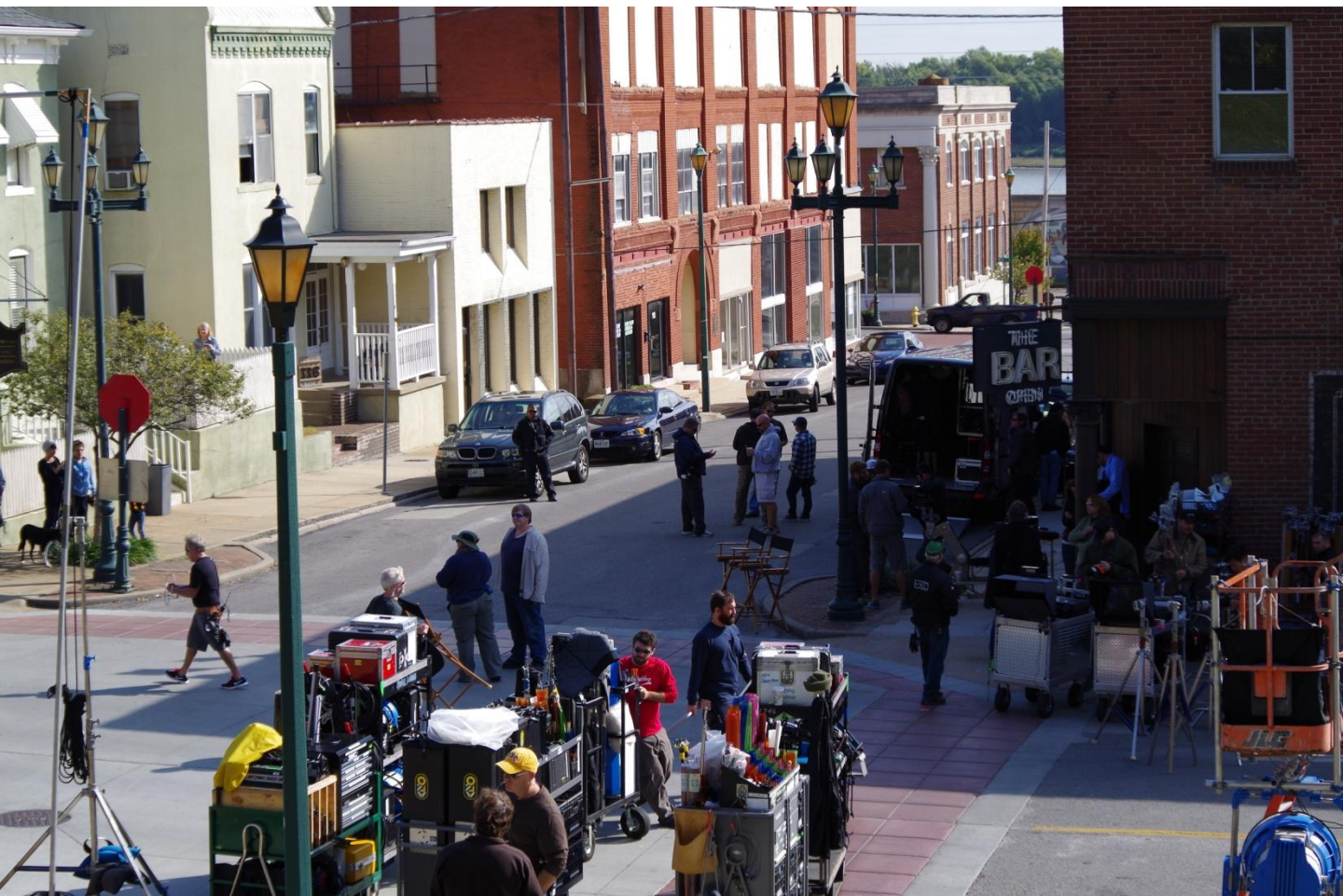
On the set of the feature film Gone Girl in Cape Girardeau